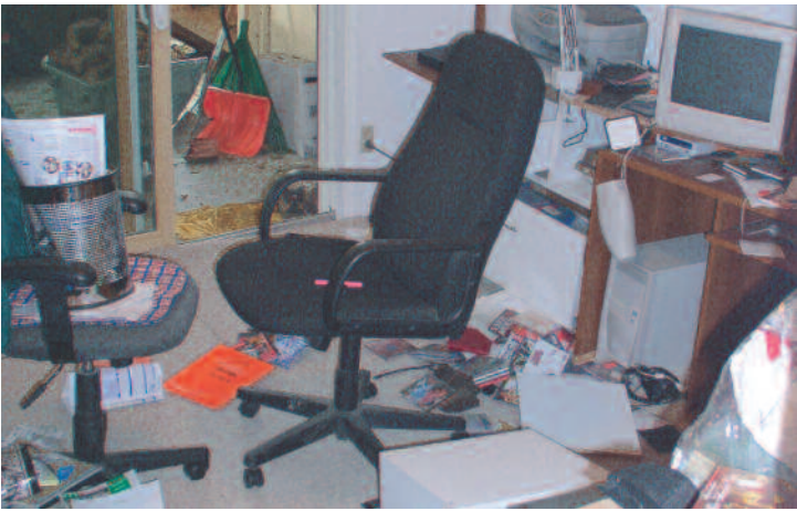
Damage caused by the 6.5 San Simeon earthquake in 2003